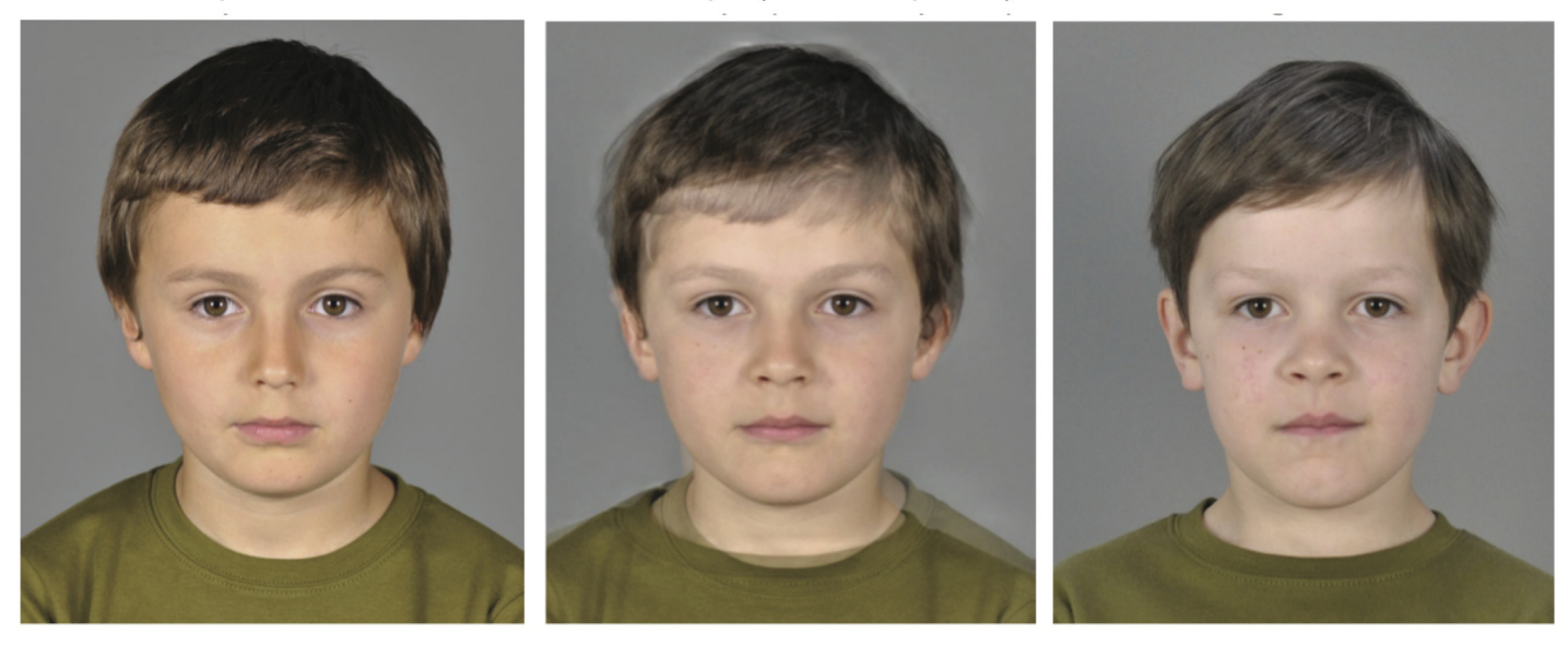
Fig 1. Facial resemblance manipulation. Shape and color information of the participant's face (left) and a face of an individual unknown to the participant (right) were blended in a 50:50 ratio to create a composite face, the Self Morph (center). Only the internal face features have been morphed. The two individuals displayed here along with their legal guardians have given permission for their photographs to be used in this figure.